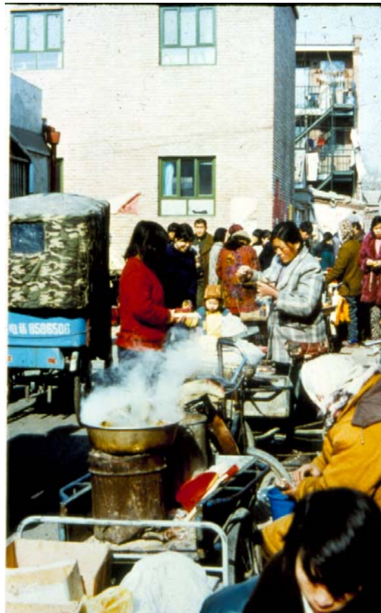
Plate 1: Migrants in Beijing

paper reports various grassroots activities that can constitute an effective means of providing health services to migrants. Though these activities cannot change formal policies immediately, they have important institutional consequences, particularly by creating a new arena for delivering health services, and also, by increasing migrants' bargaining power in the workplace. This paper is based on my documentary research conducted during the period from December 2002 to May 2003 and fieldwork investigation in Beijing and Zhejiang, China, in April and May 2003. During the fieldwork, I interviewed about 20 researchers and policy makers in the Ministry of Health, State Council Development Research Centre, Ministry of Labour and Social Security, Beijing University, Qinghua University and other institutes. I visited Dashila Street of Xuanwu District, Beijing, and its Community Health Centres, and interviewed officials, health workers and residents there. Apart from this fieldwork, I also draw on information from my earlier long-term research with migrants in China starting in 1992, particularly my work on migrants in the Pearl River delta and on a migrant community in southern Beijing.