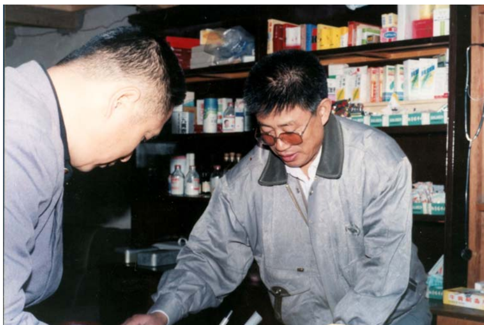
Plate 5: A Clinic Set Up by a Migrant in Zhejiang Village, a Migrant Community in Beijing

One of the biggest problems facing these alternative clinics is their lack of formal licenses from the government of the destination place. Health authorities in large cities often turn down applications for licenses from these clinics on the grounds that they fail to meet the basic standards in facilities. When the Beijing Municipal government tried to justify their repeated efforts to crack down “Zhejiang Village”, one reason given was to eliminate “illegal medical practice” there. But in fact providing health services to migrants can be an effective measure of facilitating migration management. For example, local governments can use the services to foster closer relations with migrants and to collect basic information about mobility. Given the ever-increasing medical treatment costs and the widening gap between the rich and poor in urban China, the government should seriously consider encouraging clinics catering for migrants and other urban poor.