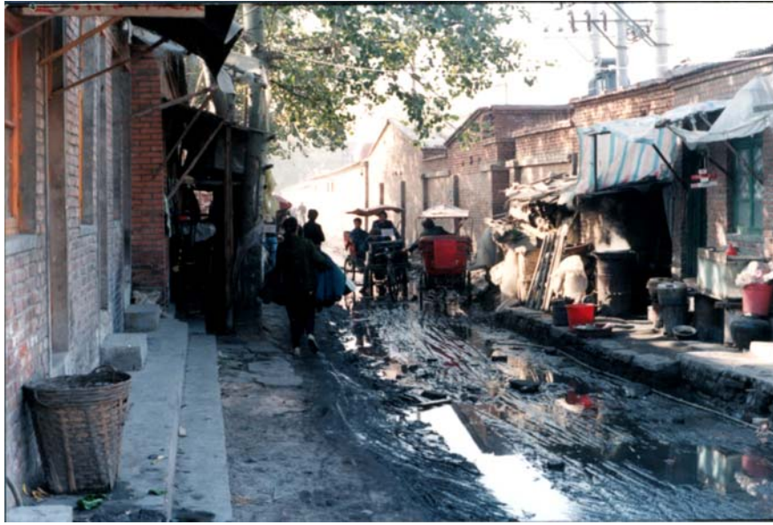
Plate 3: The Living Condition of Migrants in Beijing