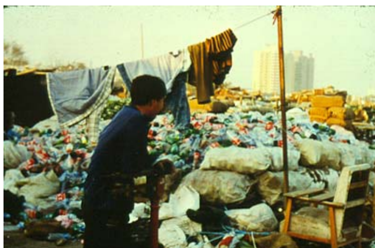
Plate 2: Rubbish Collecting is an Important Occupation for Immigrants

Work-related health problems include work-related injury and work-related illness. Based on her investigation in migrant-sending places, Tan estimates that about 1-2 per cent of all male migrant workers had work-related injuries (Tan, 2002 [2000]: 255). In 1998, Shenzhen reported 189 cases of migrant workers becoming physically disabled at work, mostly losing fingers or arms (Yu, 2001). More strikingly, it was said that there were about 300 clinics in Kai County, Sichuan Province, offering surgery to reattach severed fingers and arms. There were 200 similar clinics in Jinjiang County of Fujian Province. While the clinics in Sichuan mainly target returned migrants, the Fujian ones serve immigrants who are injured there (Huang and Zhan, 2003). A news story reports that a visit to the surgery department of a hospital in Hangzhou, the capital city of Zhejiang Province, would find that most patients are migrant workers with injuries from work (He, 2002).