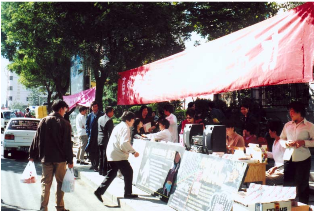
Plate 4: An Open Medical Consultation Organised by a Residential Committee in Beijing

relatively high levels of education and who are influential among fellow migrants. The Migrants' Association reports to the Street authorities on migrant women's family planning situation and help relevant institutes organise migrant women to participate in activities such as health lectures and examinations. Two companies located in Dashila Street, Tan's Fish Head and Yuanfu Hot Pot with more than 100 migrant workers each, have registered all their workers to be members of the Association. The problems with reproductive health and child vaccination among migrants as mentioned earlier to a large extent can be attributed to the underdevelopment of residential community as a channel for social service delivery, particularly in newly-industrialised areas.